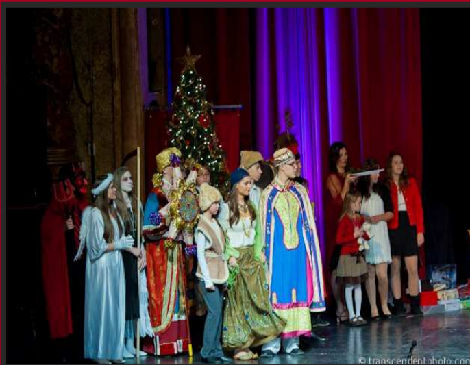
The Magic of Christmas