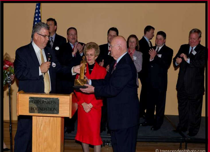
The Copernican Award

5216 West Lawrence Avenue Chicago, Illinois 60630